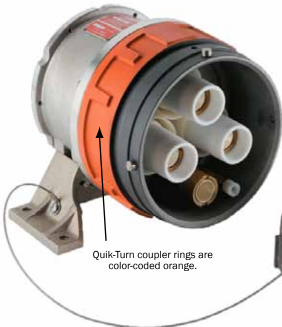
Quik-Turn coupler rings are color-coded orange.