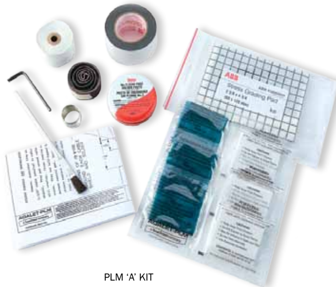
PLM 'A' KIT

PLM couplers and accessories are utilized in some of the world's most extreme environments. PLM offers a full line of spare parts for use in maintaining, rebuilding, or repairing used couplers. All individual coupler parts are available for purchase. Most are in stock and available for immediate shipment. Contact PLM or your local PLM distributor for price and availability information.